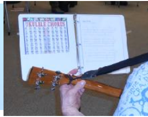
NEWSLETTER GONE TO THE DOGS STORY AT 6