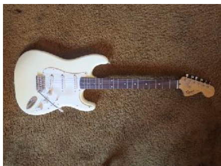
Fender Squire Stratocaster, $150.