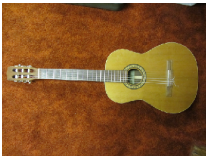
La Patrie classical guitar, handmade with case. Call for details $600