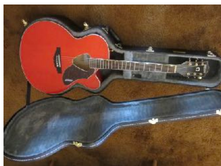
Gretsch G-5022 CE Rancher acoustic/electric (Fishman) gold hardware, new TLK case. $550