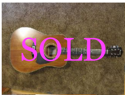
Ibanez S300 SV acoustic satin violin finish 1979 with hard