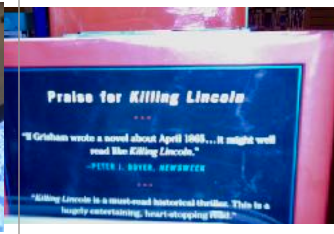
Troubling, says I Very troubling