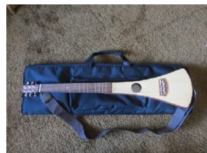
Martin Backpacker steel string $150.