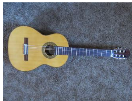
Suzuki Classical guitar $400.